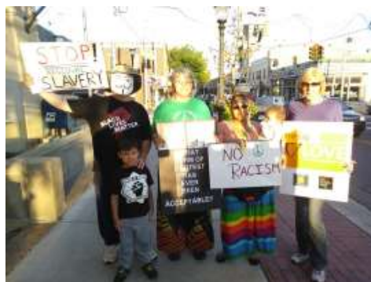
Take A Knee Rally – September 6