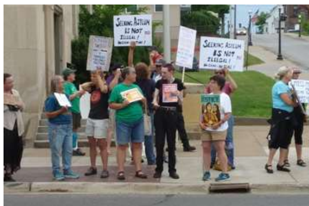
Families Belong Together – June 30

Find us on Facebook @ MqtUU Faith in Action Committee